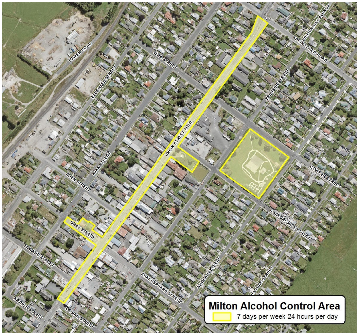
Map 2 Milton Alcohol Control Area