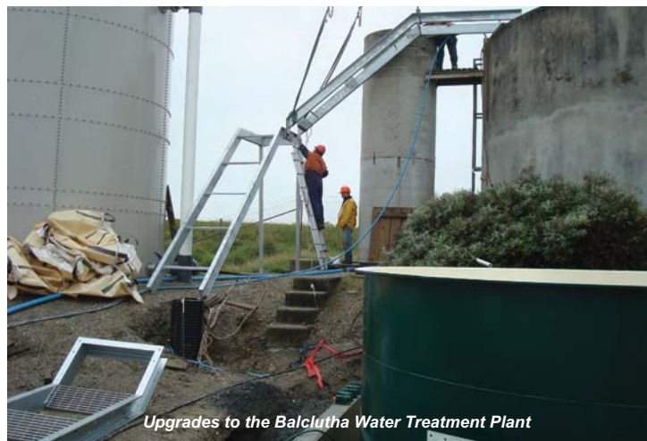
Upgrades to the Balclutha Water Treatment Plant

Major upgrades to the water supply treatments in Balclutha, Kaitangata, Lawrence and Tapanui were substantially completed in the 2010/11 year. These upgrades are due to legislation which requires all water supplies to "take all practicable steps" to comply with new Drinking Water Standards. Fluoridation of the Milton, Tapanui and Kaitangata water supplies to help improve children's oral health began in 2010/11. Resident satisfaction ratings for urban and rural water supplies declined from 2009 to 2010. However, this may be a result of a change in wording of the questions asked, rather than a decline in the actual level of service provided.