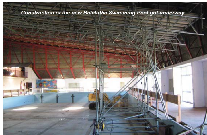
Construction of the new Balclutha Swimming Pool got underway

The ongoing problems with both pools was probably a major contributing factor to a resident satisfaction rating of just 31% for Council swimming pools. The upgrades to both Balclutha (pictured below) and Milton are expected to address issues raised by pool users.