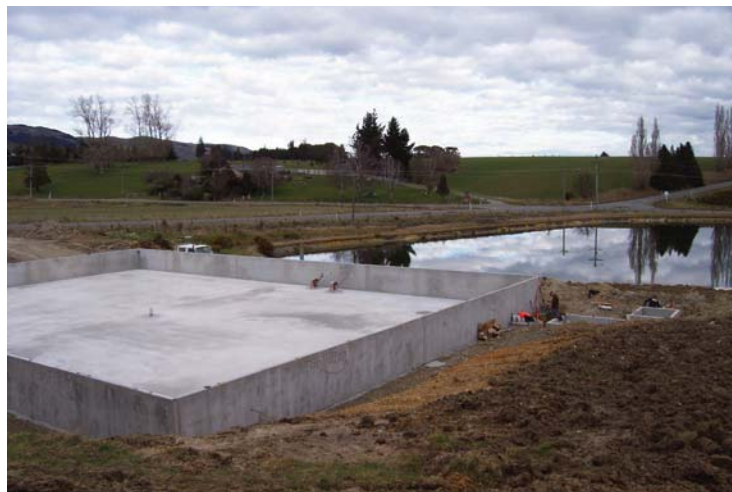
Work began on major sewage treatment upgrades in Lawrence, Owaka, Stirling and Tapanui (pictured above).