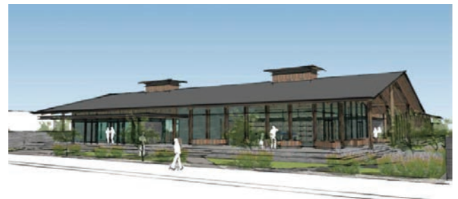
The concept design for Bruce Community Hub.

redevelopment will also benefit from funding.