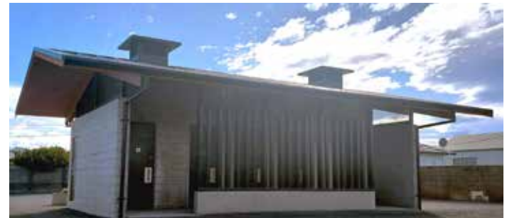
Pictured: Balclutha toilet (top) and Milton (below).