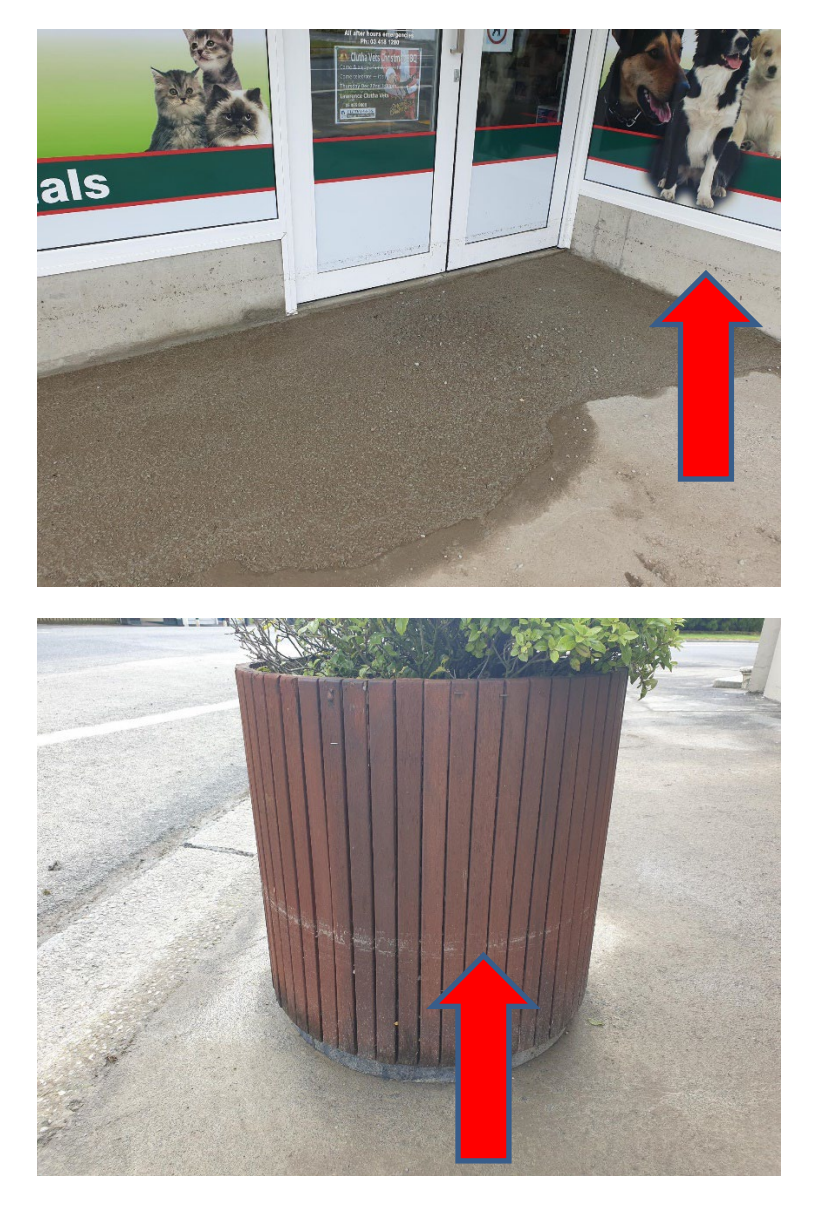
Indication of water level during 16 December weather event