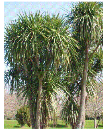
Cordyline australis (Cabbage tree)

Dark finished street lighting poles with light fittings such as Kendelier 'Mini Stork' (illustrated) would contribute a distinctive character to the subdivision