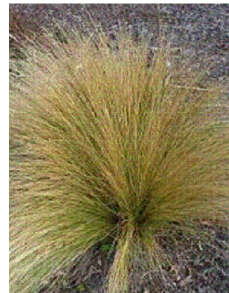
Poa cita (Silver tussock)