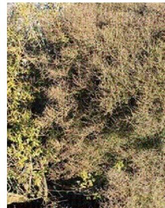
Coprosma propinqua (Mingimingi)