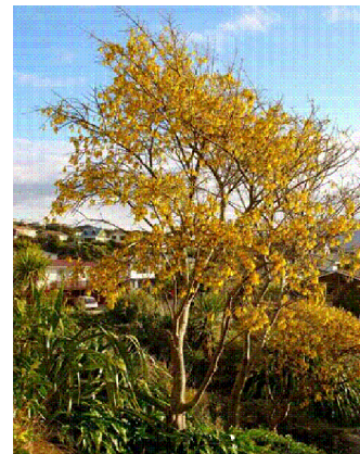
Sophora microphylla (Kowhai) - to be located in Reserve 1 and frontages of adjacent sections