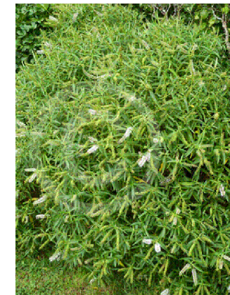
Hebe saticifolia (Koromiko) - End of Road 2 only.

Street planting beds to have coarse stone mulch where flat enough and woodchip on steeper banks.