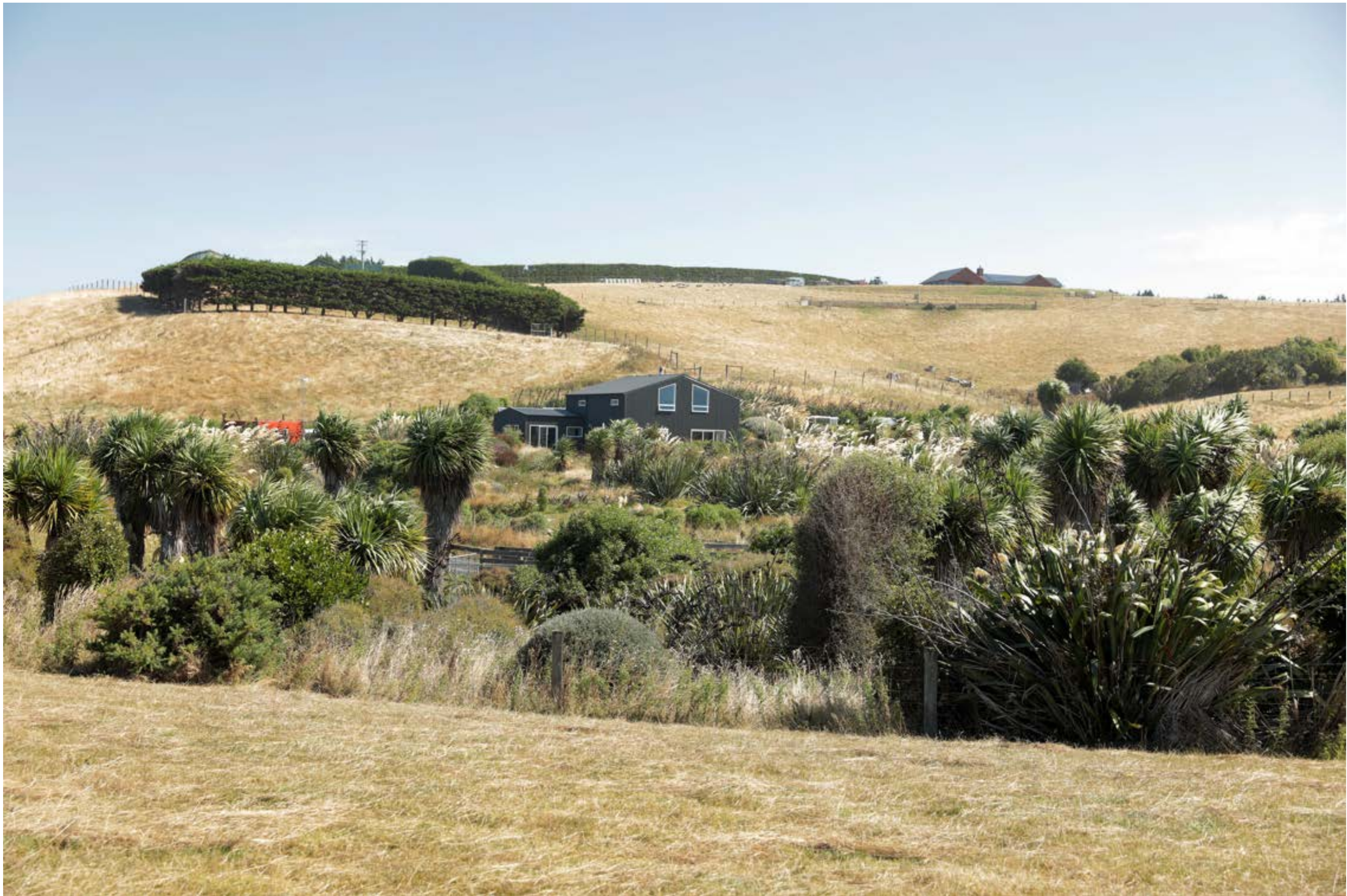
View South towards 239e Moturata Rd from approx. mid south boundary of proposed Lot 1 - 50mm lens aperture -16.15hrs - 13 February 2023