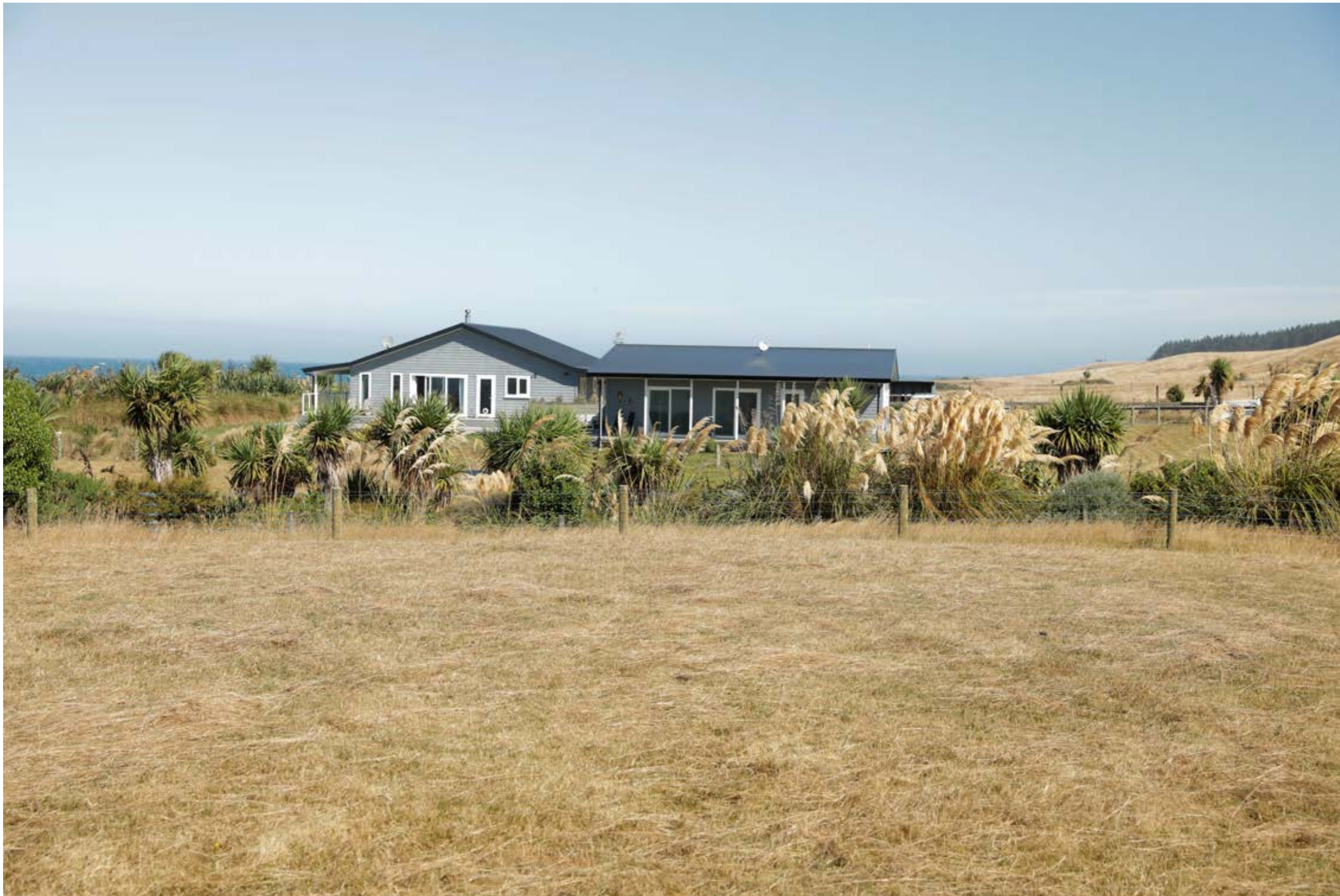
View South towards 239f Moturata Rd from approx. mid south boundary of proposed Lot 1 - 50mm lens aperture -16.15hrs - 13 February 2023