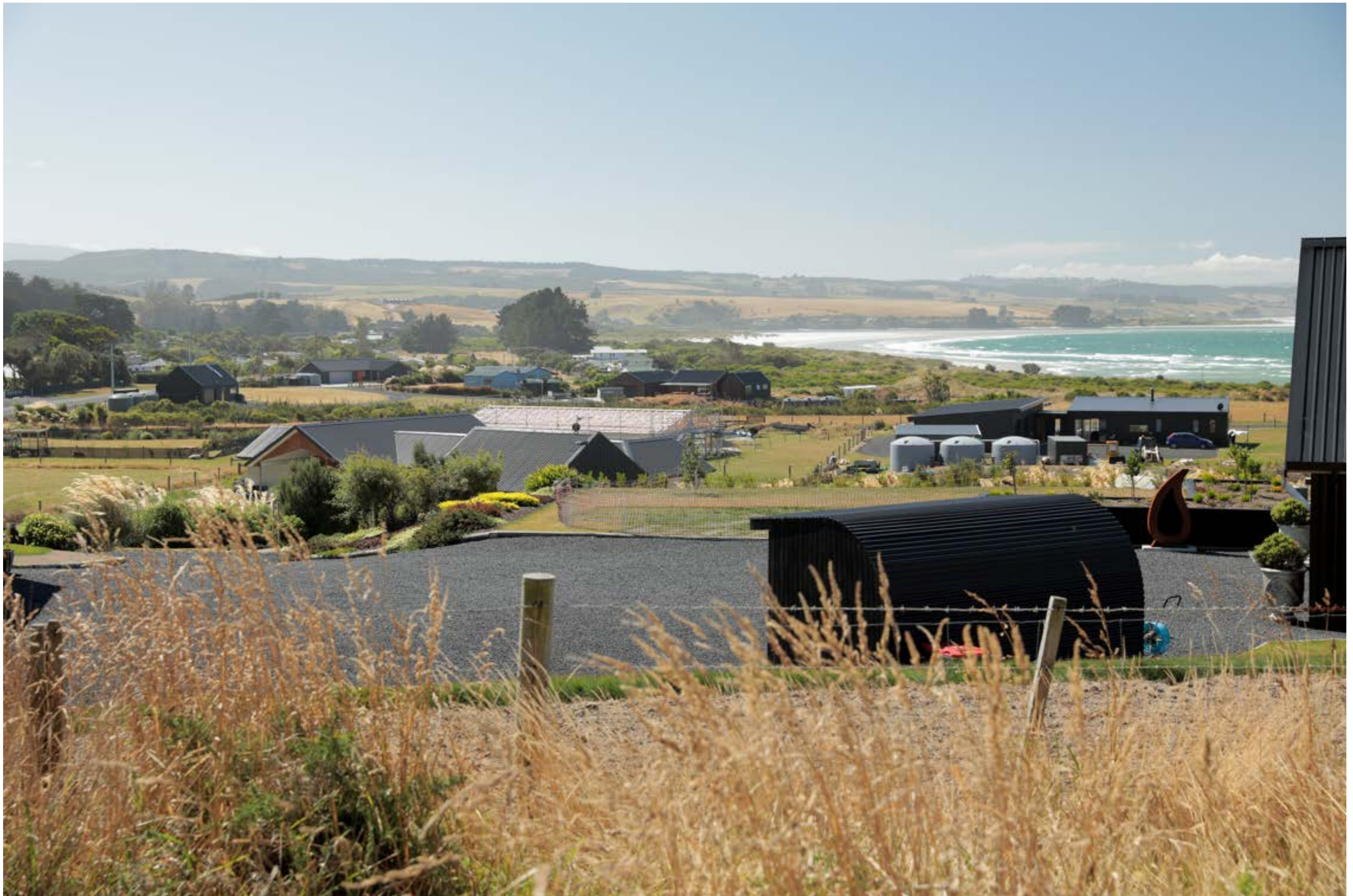
View North over recent subdivision to the coast, adjacent to 229 Moturata Rd - 50mm lens aperture -15.29hrs - 13 February 2023