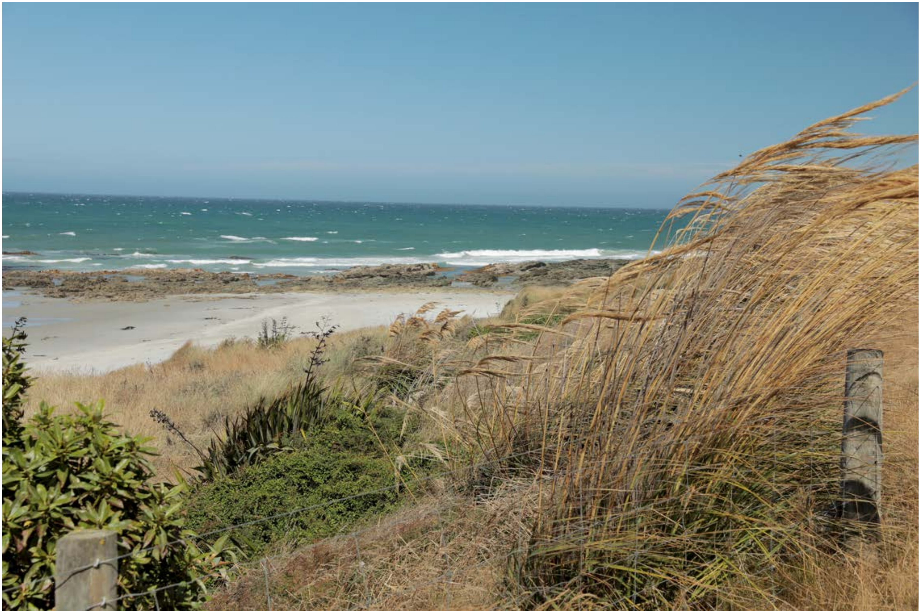
View South/West to shoreline from north/east site corner of 239d Moturata Rd - 50mm lens aperture -15.41hrs - 13 February 2023