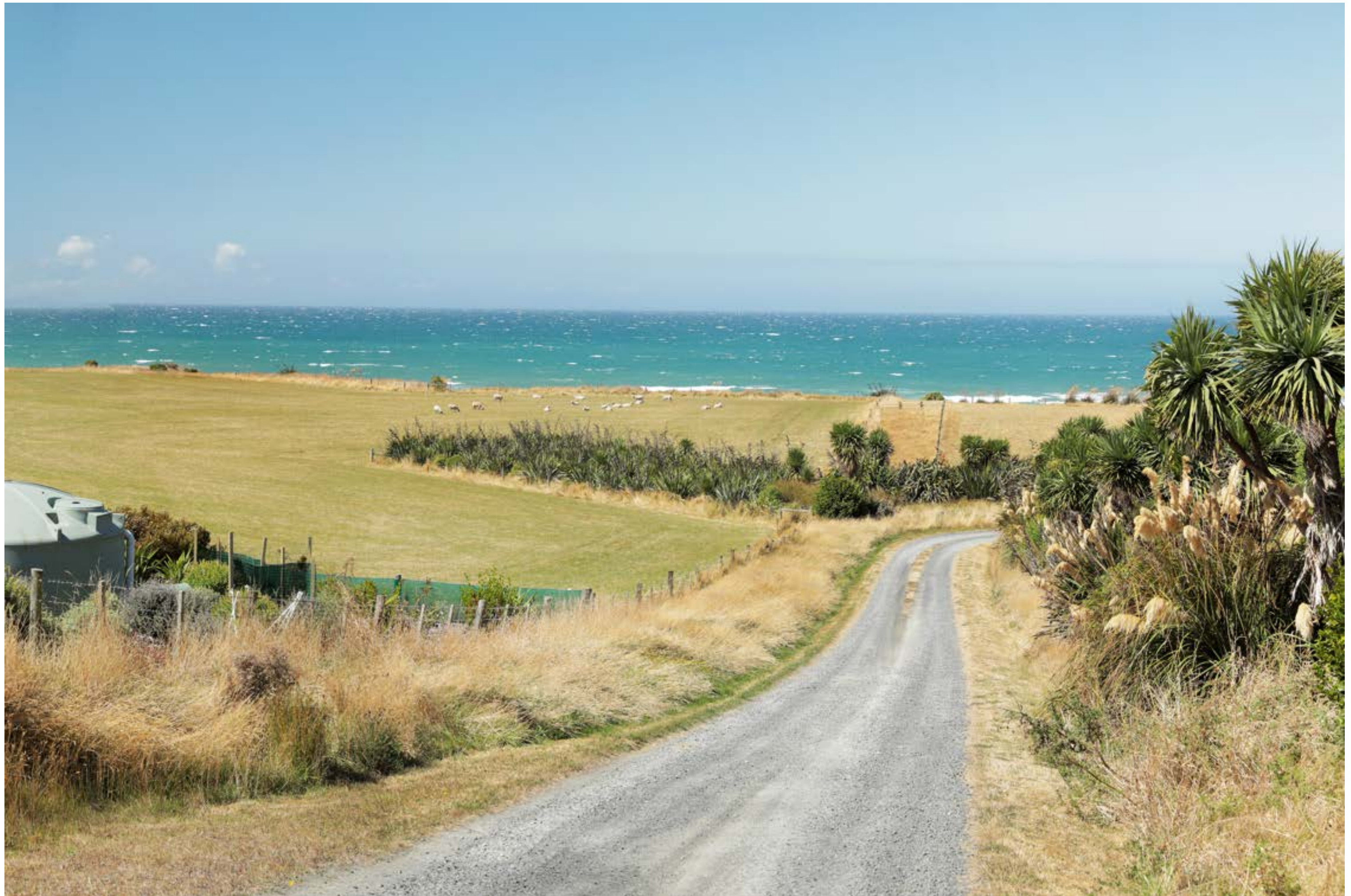
View East, down ROW to boundary of 239d Moturata Rd. Existing boundary planting is fenced off on northern site boundary - 50mm lens aperture -15.31hrs - 13 February 2023