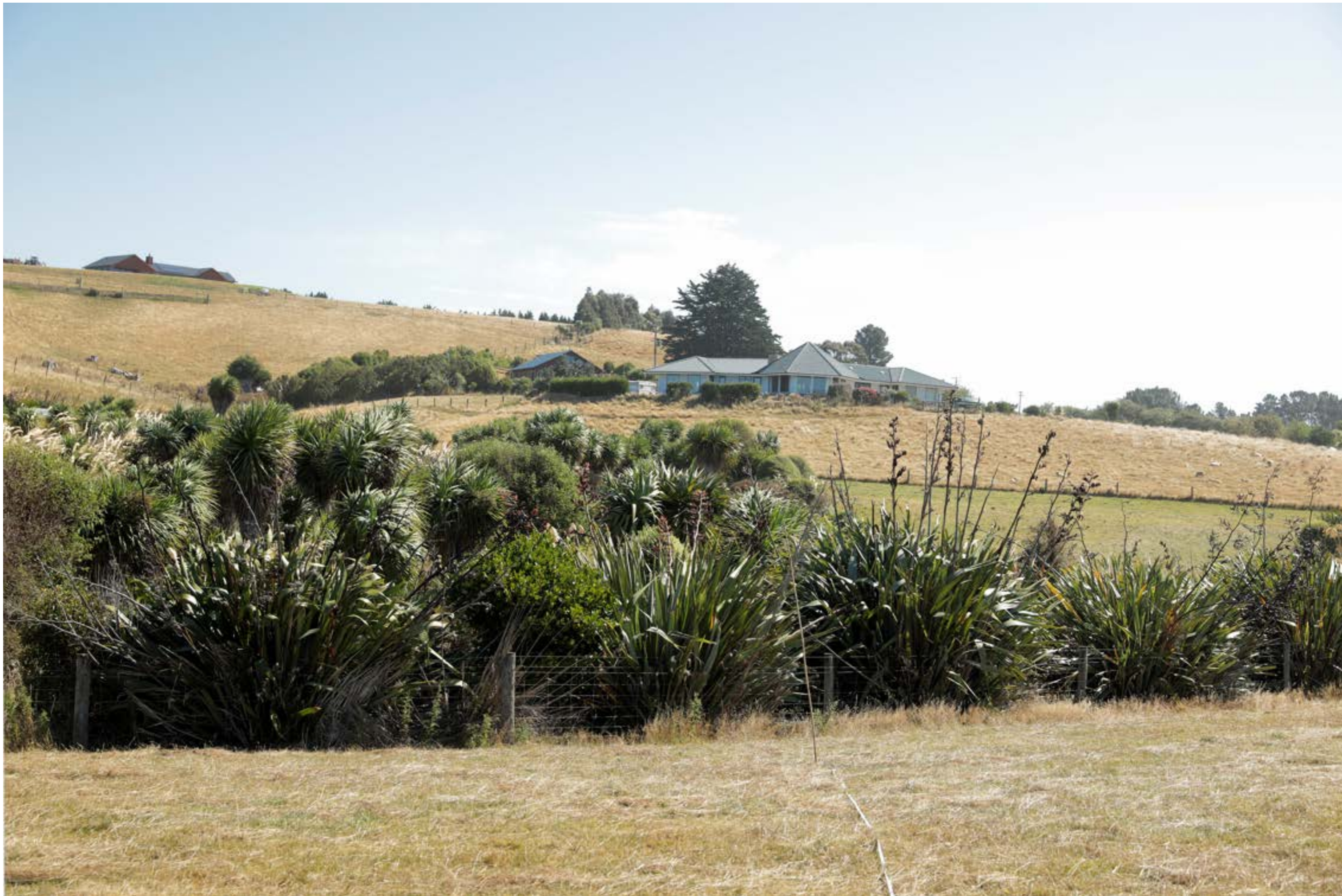
View West from approx. mid east boundary of proposed Lot 1, 239d Moturata Rd towards 7 Akatore Rd - 50mm lens aperture -15.16hrs - 13 February 2023