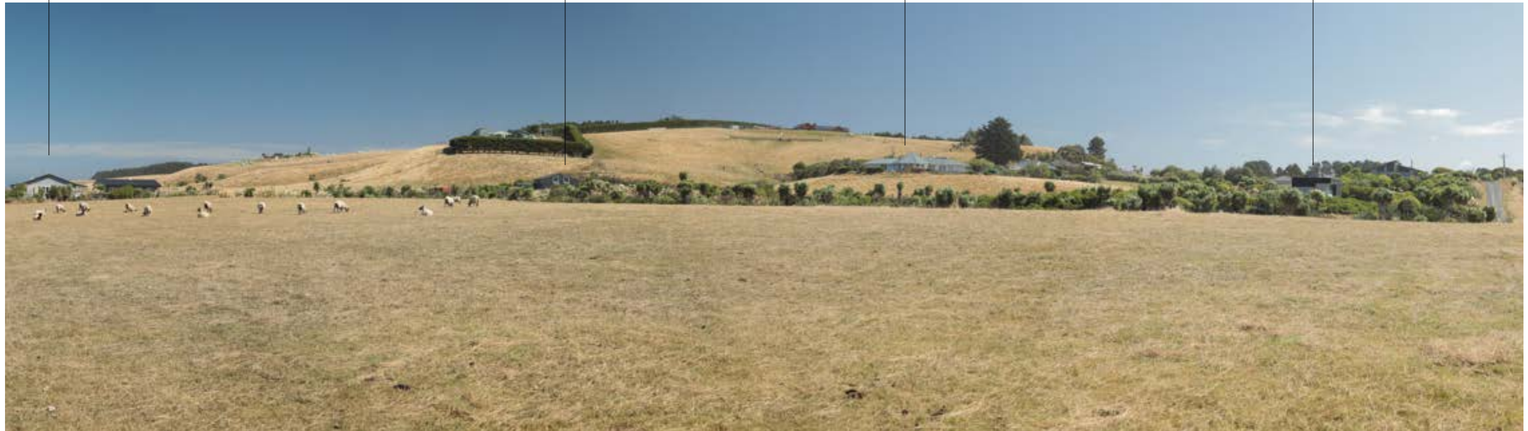
Wide angle site panorama from West to South from north/east site corner of 239d Moturata Rd, including all immediate neighbours - Approx. 24mm lens aperture -15.41hrs - 13 February 2023