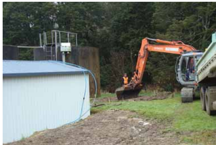
Work began on major water treatment upgrades in Balclutha, Kaitangata, Lawrence and Tapanui (pictured above).

Overall, our net operating surplus of $4.3 million is behind budget by $2.2 million. (Note that this is not a cash surplus, but is based on accounting principles incorporating accruals, non-