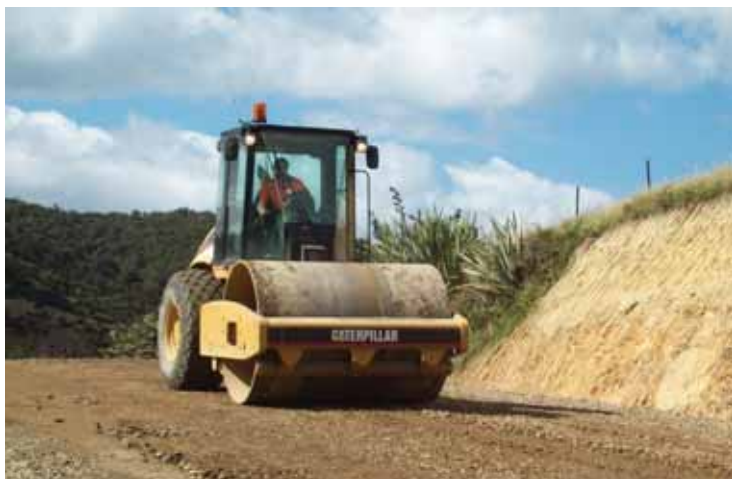
Sealing of Karoro Creek/Ahuriri Flat roads was completed (above), but all new seal extensions were put on hold in 2009/10.

Council spent $15.6 million on maintaining and improving the local roading network during the 2009/10 year. This was $4.6 million less than initially budgeted for in the 2009/10 year of the Long Term Plan.