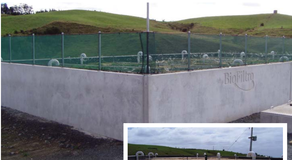
Biofiltro sewage treatment plants with bioactive sawdust beds, such as the Kaka Point plant pictured here, will be installed at four other townships in the district.

*Harmonisation is where the maximum household charge for urban water and sewerage charges is capped at 1.25 times the average rate. In practise, this means that most water and sewerage customers pay a small amount extra each year so that consumers in communities with high water and/or sewerage charges pay a lot less.