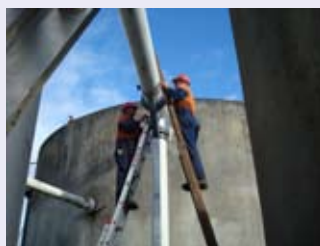
Water Treatment Upgrades Began: 2010 Completion: Summer 2011/12

Water Treatment Upgrades: Work is nearing completion on major water treatment upgrades for Balclutha, Kaitangata, Lawrence and Tapanui. These upgrades are due to legislation which requires drinking water supplies to "take all reasonable practical steps" to comply with the New Zealand Drinking Water Standards. The upgrades received significant funding assistance from central government. The Balclutha, Kaitangata and Tapanui upgrades are now largely completed while work was getting underway on the Lawrence upgrade at the time this newsletter went to print.