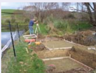
Biofiltro Upgrades Began: June 2011 Completion: Winter 2011

Sewage Treatment Upgrades: Site works are now underway for the new Biofiltro sewage treatment facilities at Lawrence (pictured), Owaka, Stirling and Tapanui. These new facilities are intended to comply with stricter effluent quality conditions in the newly issued discharge consents. The Otago Regional Council has granted a new 35-year discharge consent for each respective scheme based on them upgrading to a new Biofiltro sewage treatment plant such as the one which has been operating at Kaka Point since the beginning of 2010. Construction is expected to be completed some time this winter.