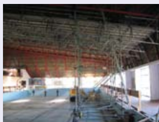
Balclutha Pool Upgrade Began: May 2011 Completion: Early 2012

Work is progressing well on the $3.5 million upgrade to the Balclutha Pool. The changing rooms and old gym areas have been gutted while preparations have been made for the removal and replacement of the old asbestos roof. The upgrade will also include a reconfiguration of the current Learner's Pool to provide a better and safer area for toddlers with a shallower 'beach' entry pool, a renewal of the heating and ventilation system and upgraded pool entrance. Efforts are underway to fundraise the additional $169,000 required for a therapeutic pool and bulk head for the main pool.