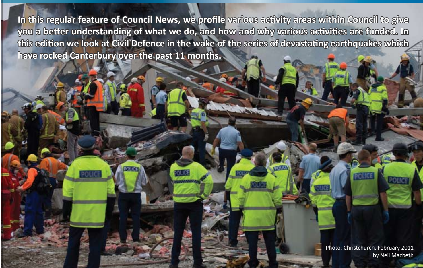
Photo: Christchurch, February 2011

In this regular feature of Council News, we profile various activity areas within Council to give you a better understanding of what we do, and how and why various activities are funded. In this edition we look at Civil Defence in the wake of the series of devastating earthquakes which have rocked Canterbury over the past 11 months.