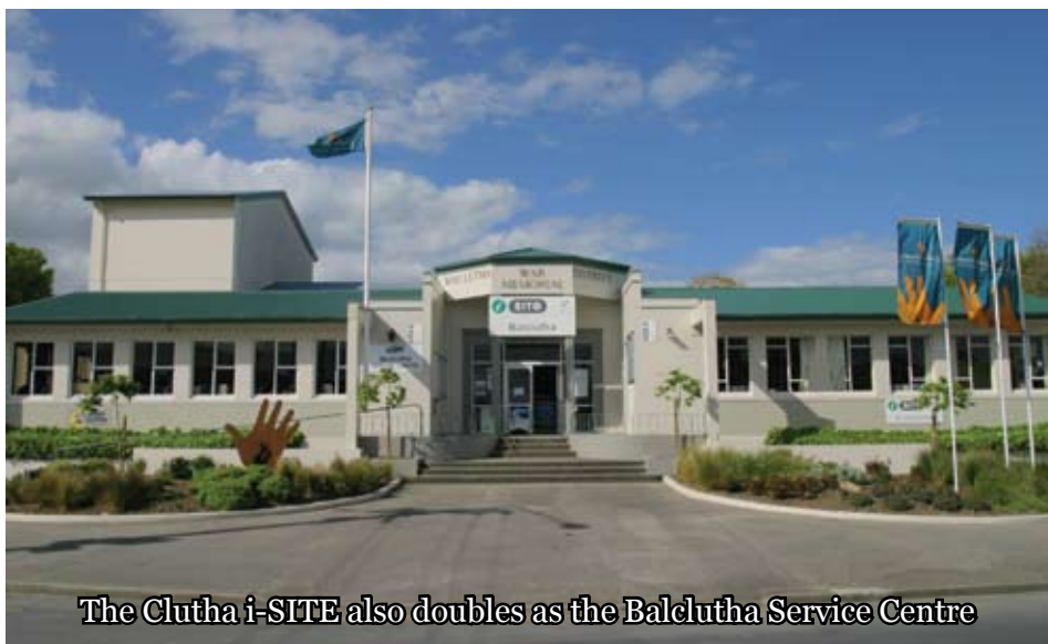
The Clutha i-SITE also doubles as the Balclutha Service Centre

1 Suffolk Street, Tapanui Phone: 03 204 8306 Hours: Mon-Thu: 8.30am - 5pm Fri: 8.30am - 5pm (Service Centre) Fri: 8.30am - 6pm (Library)