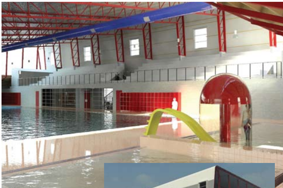
An artist's impressions of the upgraded Balclutha Centennial Swimming Pool.

The changing room rebuild however, is expected to cost in the vicinity of $684,000. This work will be completed before the start of the 2011/12 swimming season, subject to consultation with the community. Look out for more information on this in the new year.