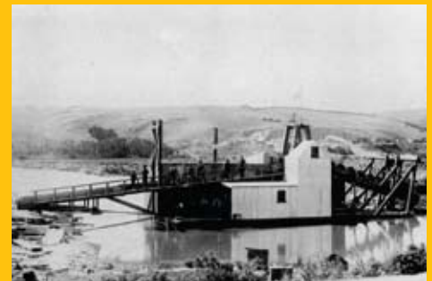
Dredge at Tuapeka Flat, 1900

There will also be an opportunity for Pioneer Storytelling during the weekend. Descendants are invited to retell Goldrush stories which have been handed down through