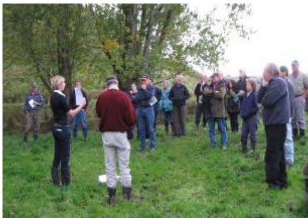
Discussion of preliminary results at the April 2010 Field day