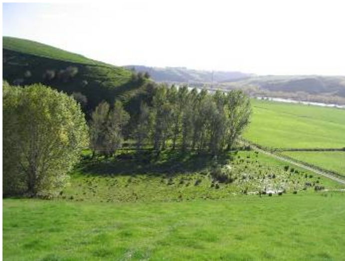
The trial site before fencing and planting – April 2006

The development of the site into the demonstration area was begun in May – July 2006. It was fenced with a sheep mesh with an electrified top wire by the host farmer. This was to prevent ‘accidental’ grazing of the area by stock. Some digger work was also undertaken by the farmer to prevent drainage at the northern corner of the site and direct all drainage from the site through the eastern outlet to the drain out to the river. In this way, the wetland will contain all the water, have it run through the existing and new plantings, then also across the native area that is currently being worked on.