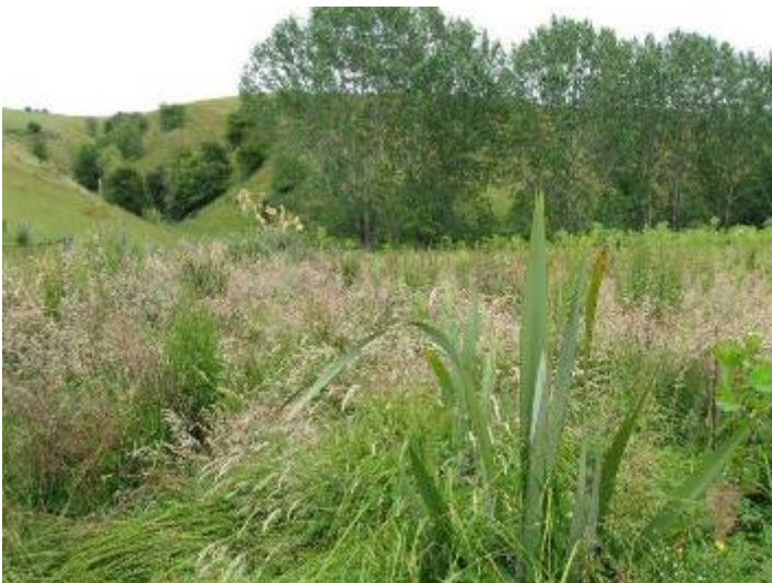
Summer growth before grazing, January 2010

grazing also occurred around the time of the April Field Day. Then the willows were cut to coppicing height manually by a youth taskforce group in July 2010. At this time 400 cuttings were also taken to be used elsewhere on the farm with further plantings, some to help stabilise some riverbanks.