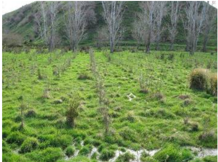
Early spring conditions, September 2009

At the start of the year four extension to the project, in the spring 2009, it was decided to give the willows a chance to establish stronger root systems and leave stock out more than in previous years. 6 bulls grazed the block for 4 weeks from mid January. Further