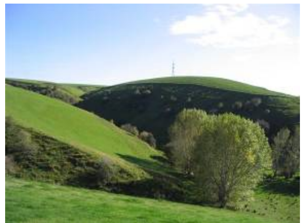
Surrounding paddocks to show likely runoff situation