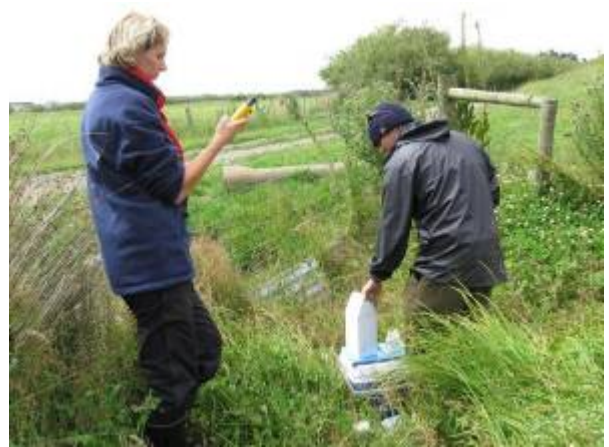
Water testing at Site 4