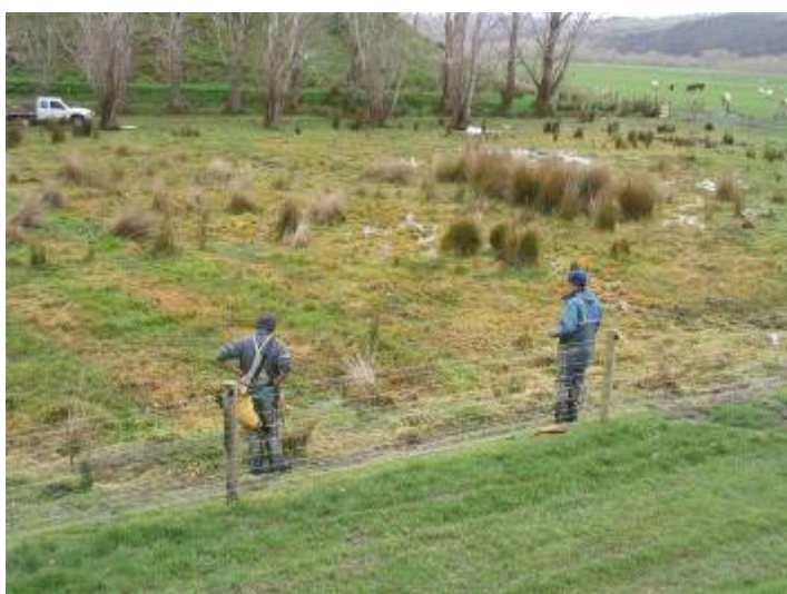
Fencing and spray lines ready for planting

In late July the area was sprayed with glyphosate in preparation for the planting. Rows were sprayed 1.5m apart in an approx. east-west direction. The planting took place on 8 September 2006 - approx 1175 Kinuyanagi willows which had previously been cut and stored from the Willows Project at Sharpins (SFF 04/089) were planted approx. 1m apart. They were well rooted and approx 30-40 cms in length. Many were planted in very swampy conditions but in the month after planting there were drying conditions. Survival was approx. 90% and most had grown to between 0.5m and 1.0m by February 2007.