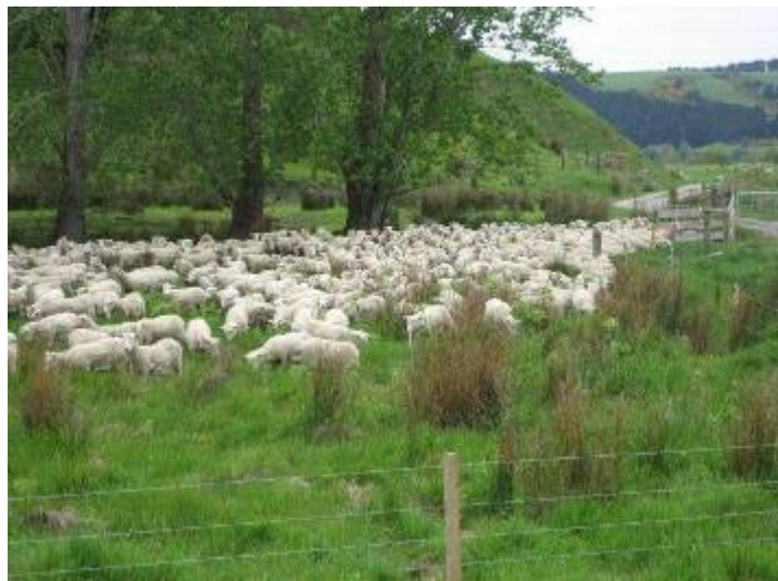
Hoggets graze the second year growth in November

In the second year there was light grazing by 600 hoggets for 12 hours in early November 2007. This was necessary because the rank spring pasture and weed growth was competing with the willows and slowing down their dry matter production. This was a year of below average summer and autumn rainfall. While it was good for the willows that they did not have to contend with boggy conditions while establishing, it did mean less flexibility with what the farmer could do with his stock.