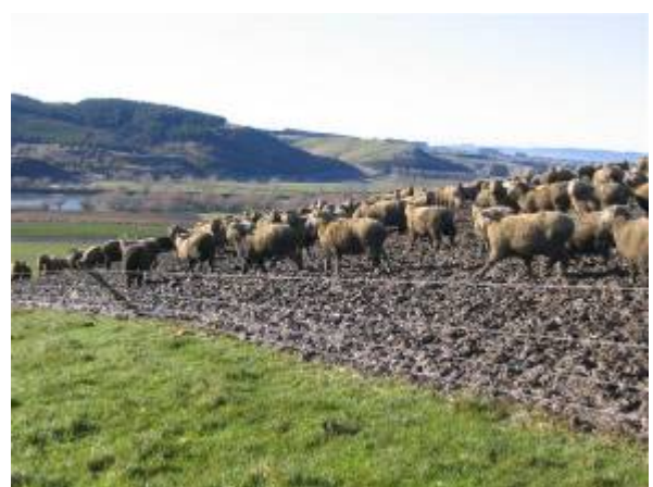
Winter feeding on surrounding paddocks will have caused some of the runoff