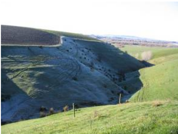
Winter scene from the head of Site 1 gully, looking down towards the wetland