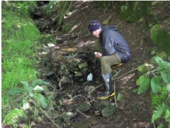
Water testing at Site 1