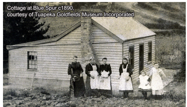
Cottage at Blue Spur c1890

Tickets to the following events will be available from Ticket Direct from February 2011: The Drama of the Tuapeka (Friday 18 March), Swaggers Dance (Saturday 19 March), and the Sesquicentennial Ball on Sunday 20 March.