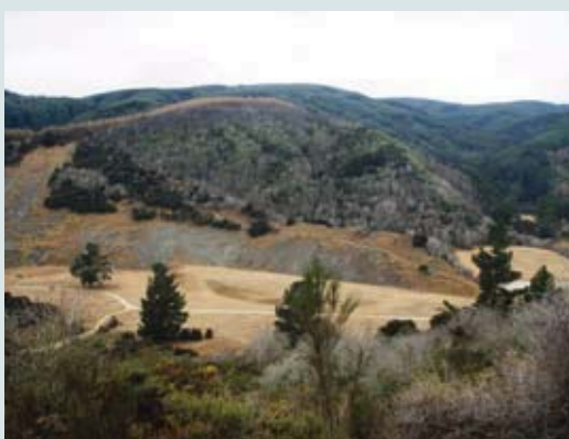
Gabriel's Gully today