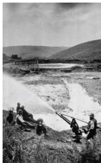
Sluicing at Waitahuna

Various methods of mining continued in the area for over 80 years after the first discovery of gold. Approximately 295kms of races were constructed to bring water from the hills for sluicing away surface material to reach the gold bearing cement below. The outline of a former water race may be seen on the hillsides on the left when