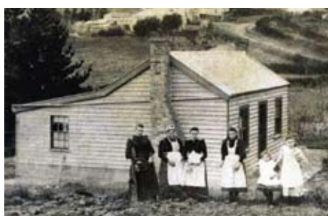
Blue Spur Cottage, c.1890