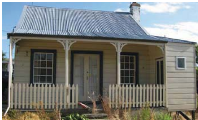
Lawrence Chinese Camp's Joss House now situated on Maryport Street in Lawrence

With the loss of miners to other goldfields, the Provisional Government in 1865 invited Chinese miners from the goldfields in Victoria, Australia to come and work at the Tuapeka goldfield. Chinese miners started to arrive in Tuapeka in 1866. They reworked a lot of the harder areas that the other miners had left as unproductive but through their perseverance, determination and hard work they were able to make a living. Their arrival caused political and social reaction, often amounting to intolerance and persecution from the township folk. Anti-Chinese feeling was such that the Chinese tended to move together and live in separate camps. In 1867, a borough council bylaw prohibited the Chinese from camping or settling in the township of Lawrence, so a Chinese camp was established on designated ground just outside the Lawrence town boundary. Within the camp the Chinese established their own stores, a hotel, gambling dens and a Joss house (relocated to Maryport Street in Lawrence) in an area of less than an acre. In 1883, a visitor to the camp described it as narrow, dark and dingy with buildings constructed of boards, kerosene tins and sugar bags. Sadly part of the camp was destroyed by fire in 1898.