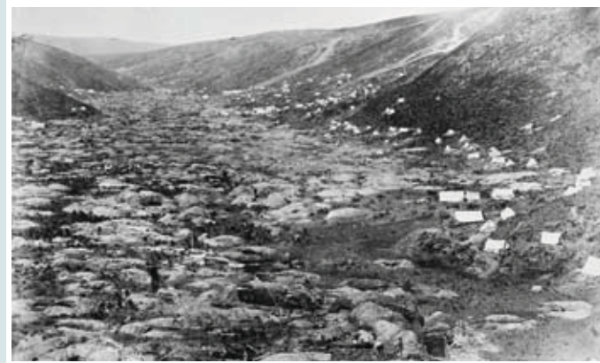
Gabriel's Gully at its peak, no trees but many people, tents and piles.

Hydraulic elevators were introduced to the goldfield later on, sluiced gravel would be raised by suction and water pressure. Gabriel's Gully was to become well known for its mammoth engineering feats, the introduction of new techniques and its longevity as a goldfield. Above