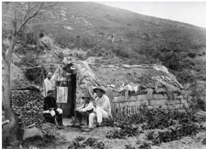
Early Chinese miner's dwelling

The image to the left shows an ordered settlement of weatherboard cottages with a street lamp and permanent ladder for lighting the lamp. Plans are in place to rebuild the Chinese camp as a heritage site and tourist attraction.