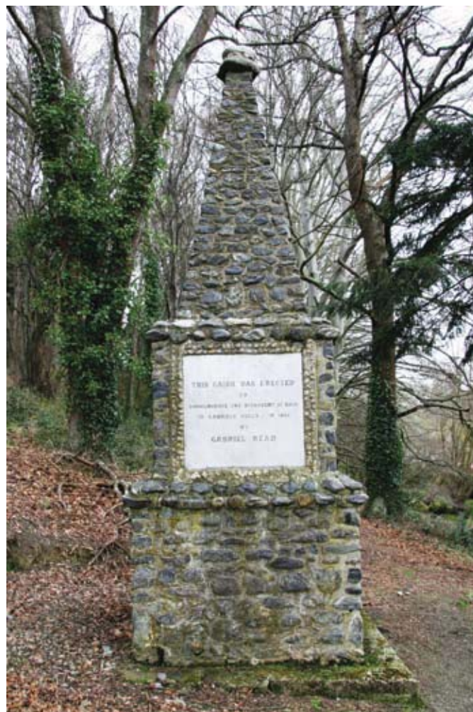
Gabriel Read Cairn Memorial at the entrance to Gabriel's Gully

This was a tragic end of the man who directed the destiny of Otago along new and prosperous paths.