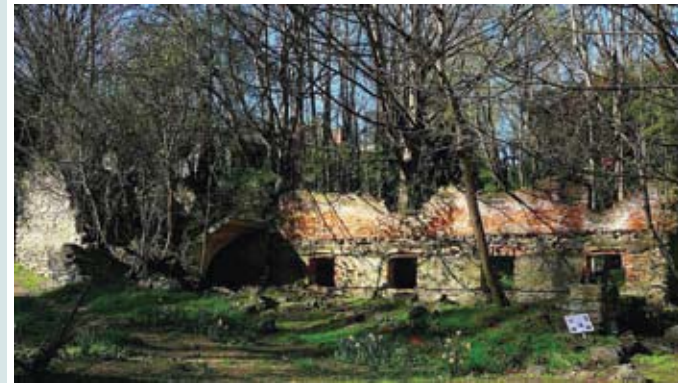
Remains of Hart's Black Horse Brewery at Weatherstons

Although only one gully east of Gabriel's Gully the Weatherstons goldfield was not discovered until mid July 1861, when the Weatherston brothers found gold while on a pig shooting trip. The field grew very fast with the Otago Witness reporting on November 30 "that 1,500 miners had arrived at Weatherstons from Waitahuna over a few days".