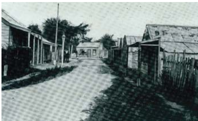
Lawrence Chinese Camp, circa 1904

With the loss of miners to other goldfields, the Provisional Government in 1865 invited Chinese miners from the goldfields in Victoria, Australia to come and work at the Tuapeka goldfield. Chinese miners started to arrive in Tuapeka in 1866. They reworked a lot of the harder areas that the other miners had left as unproductive but through their perseverance, determination and hard work they were able to make a living. Their arrival caused political and social reaction, often amounting to intolerance and persecution from the township folk. Anti-Chinese feeling was such that the Chinese tended to move together and live in separate camps. In 1867, a borough council bylaw prohibited the Chinese from camping or settling in the township of Lawrence, so a Chinese camp was established on designated ground just outside the Lawrence town boundary. Within the camp the Chinese established their own stores, a hotel, gambling dens and a Joss house (relocated to Maryport Street in Lawrence) in an area of less than an acre. In 1883, a visitor to the camp described it as narrow, dark and dingy with buildings constructed of boards, kerosene tins and sugar bags. Sadly part of the camp was destroyed by fire in 1898.