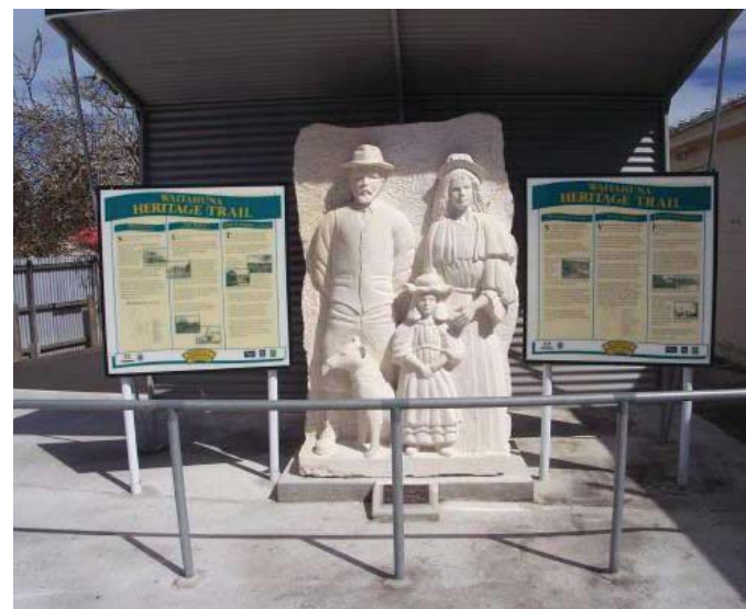
Waitahuna information board on Boyldon St

From 1861 to 1874, 156,603 oz of gold was mined in the Waitahuna area. Mining ceased in the Waitahuna area in 1947.