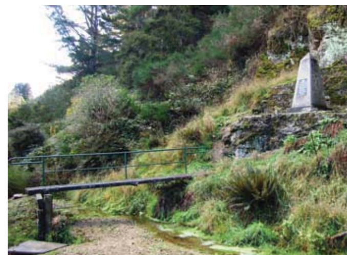
Waitahuna Gold Miners Memorial situated on Waitahuna Gully Road