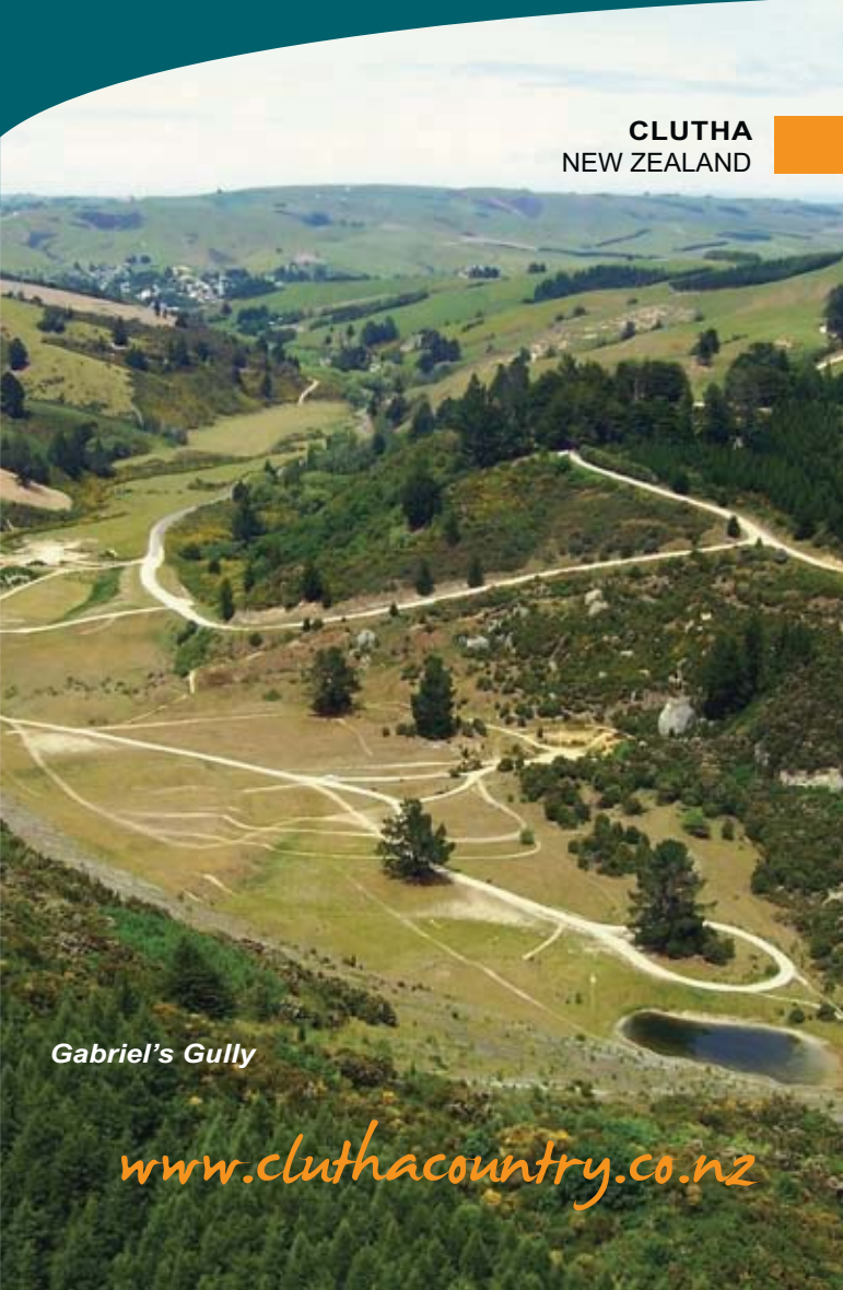
CLUTHA NEW ZEALAND