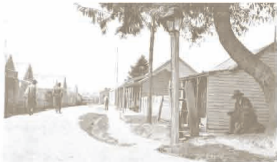
Main street, Chinese Camp 1904.

By the 1870s the Chinese Camp had stores, a hotel, boarding houses, physicians, a butchery, gambling facilities and opium dens. The permanent residents of the camp were all Chinese trades' people but it also had a population of temporary residents comprising the miners who came periodically to replenish supplies, itinerants and sick people, altogether about a hundred people. The camp eventually became a major attraction in the region and during the Chinese New Year attracted many Chinese and European visitors. The last resident of the camp, Chow Shim, died in 1945.