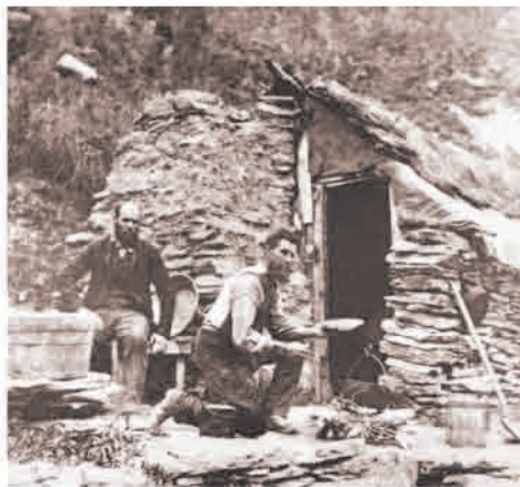
Otago gold miners' camp