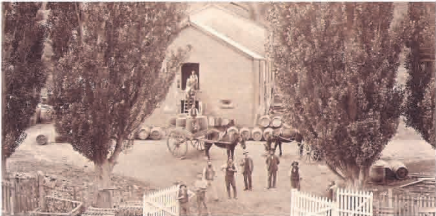
Hart's Black Horse Brewery 1897

1pm, MEET AT LAWRENCE INFORMATION CENTRE & MUSEUM