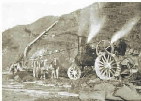
Pumping water for mining with a traction engine at Lawrence, Otago Witness

See Saturday's listings for full details of these events