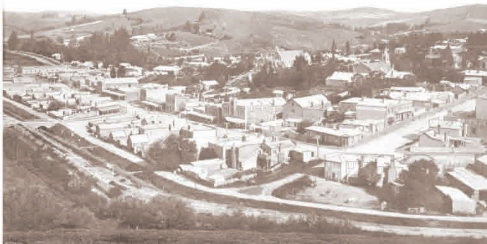
Lawrence 1908, then the centre of an extensive gold mining district. Otago Witness